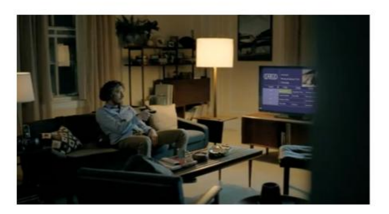
Direct TV: Don't Sell Your Hair to a Wig Shop http://www.youtube.com/watch?v=CCuPyLeDzng

Vocabulary: Conditional Statement Hypothesis Conclusion Law of Syllogism